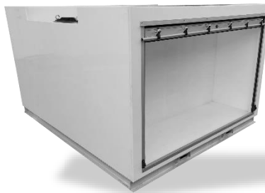
Available with Forklift Pocket Base