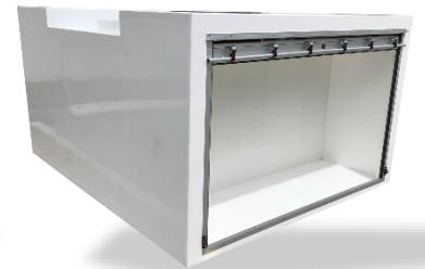
Safely Access Reels, Pumps & Tanks