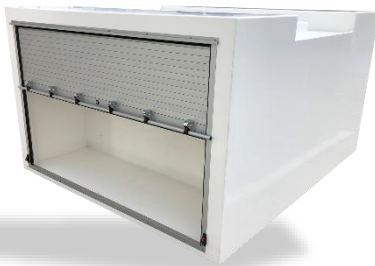
Roll-Up Doors Secure Storage Mini-Warehouse!