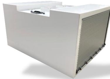
Smooth Surfaces for Logos & Marketing