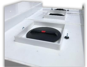
Compact Multi-Tank Configurations