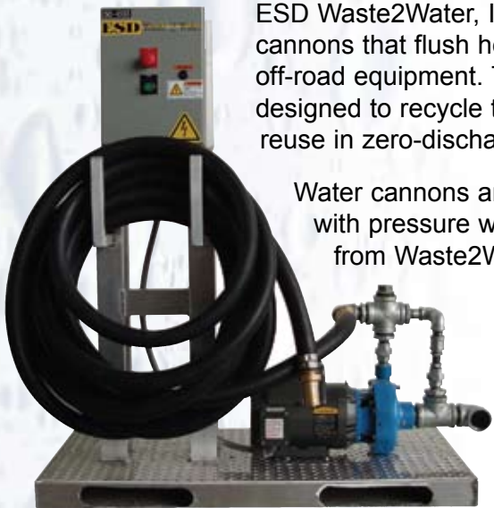
Skid Mounted Water Cannon Model 953

ESD Waste2Water, Inc. offers powerful water cannons that flush heavy mud and debris off of off-road equipment. The water cannons are designed to recycle the water from a mud pit for reuse in zero-discharge applications.