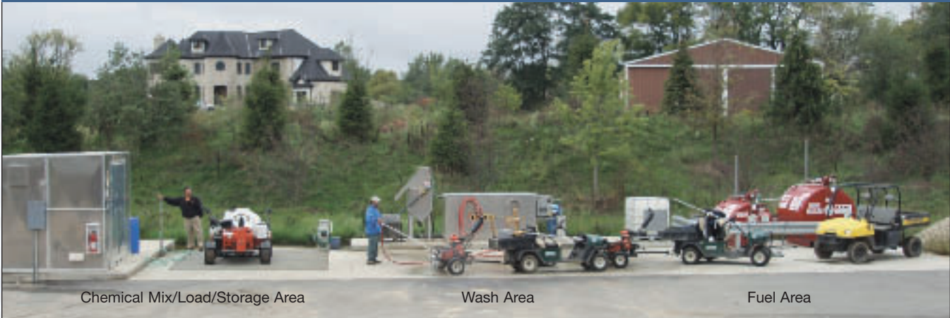
Chemical Mix/Load/Storage Area