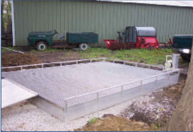
In-Ground for Temporary Application