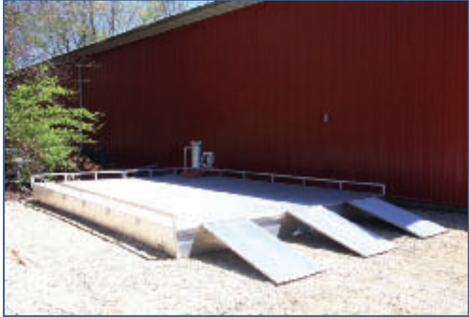
Outside on a Bed of Rocks