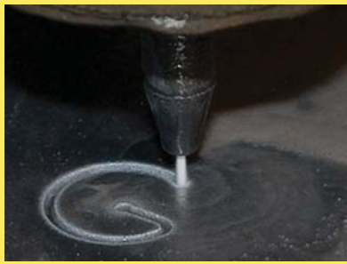
Our water jet using 50,000 psi can accurately cut steel up to 8 inches thick

Located in Central Florida, ESD Waste2Water, Inc. is a worldwide leader in industrial wastewater treatment and environmental remediation. We design, manufacture, install and service environmental protection systems for clients across the United States, Canada, Europe, South America and Australia. ESD Waste2Water leads the industry with cutting-edge technology and clever, low-maintenance designs, backed by superior customer service.