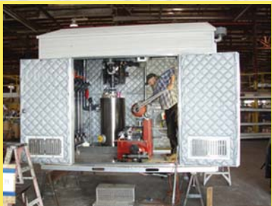
Remediation system in custom enclosure being assembled

We have a complete metal fabrication area with brake presses, metal shearing equipment and a high-precision, computer-controlled water jet metal cutting system.