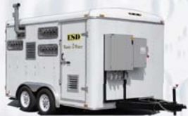
Low-Profile Air Stripper