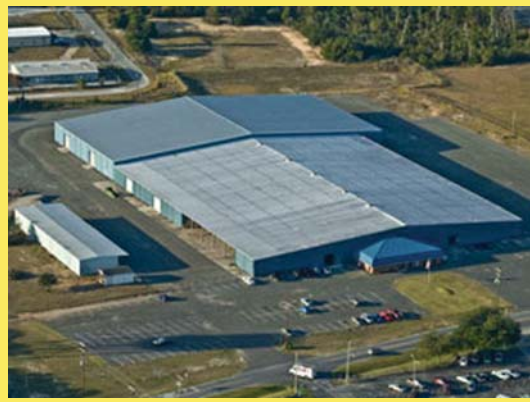
Corporate Headquarters - Ocala, FL 180,000 sq. ft. Manufacturing Facility

ESD Waste2Water specializes in helping customers develop Remediation Systems that are effective and environmentally friendly. Our line of remediation equipment sets the standard for the entire industry. Our package treatment systems are mounted on marine grade aluminum skids, or inside trailers or building enclosures. ESD's products can be custom tailored to individual specifications to meet the rigid requirements of your process needs. ESD's in-house design, engineering, fabrication, construction and technical support team will work with you to provide cost-effective and environmentally sound solutions. Our professional staff is committed to providing the highest quality, most reliable and technologically sound equipment, on schedule and within budget, supported by unparalleled customer service.