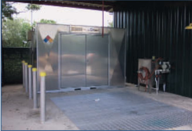
Outside on a Bed of Rocks